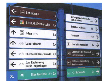
Figure 3 ORALITE® 5400 Commercial Grade