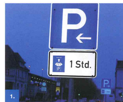
Figure 1 ORALITE® 5710 Engineer Grade Premium

Please Note: Strictly intended for adhesion onto even surfaces