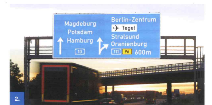
Figure 1 and 2 Typical application examples for the ORALITE® 5900/5010 High Intensity Prismatic Grade